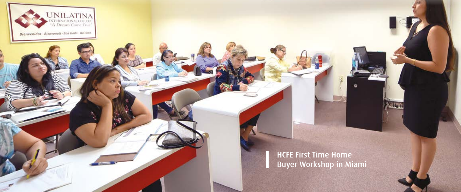
HCFE First Time Home Buyer Workshop in Miami