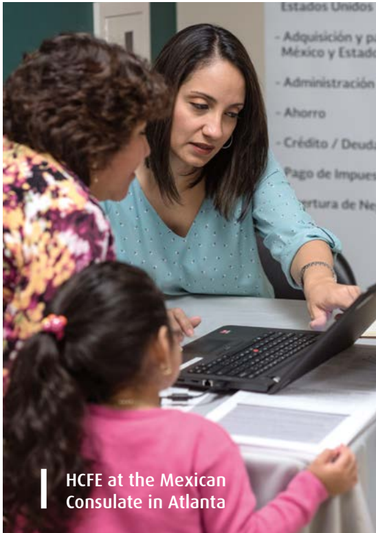
HCFE at the Mexican Consulate in Atlanta

HCFE advisors in Atlanta and Miami helped effect positive financial changes for over 2,200 first- and second-generation immigrants in 2017, providing critical education and direction on navigating the U.S. financial system and achieving long-term financial security. A generous two-year grant from the SunTrust Foundation provides full operating support for the centers and allows the HCFE to reach thousands of new Hispanic clients in need of direct financial guidance and education.