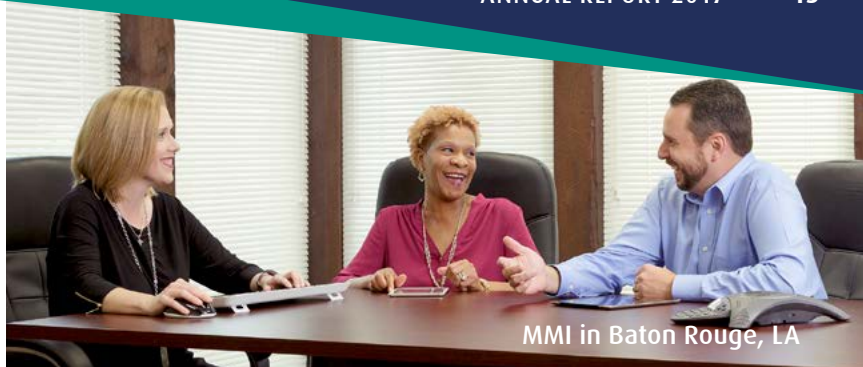
MMI in Baton Rouge, LA

Changing How America Overcomes Financial Challenges; One Person, One Experience, One Solution at a Time.